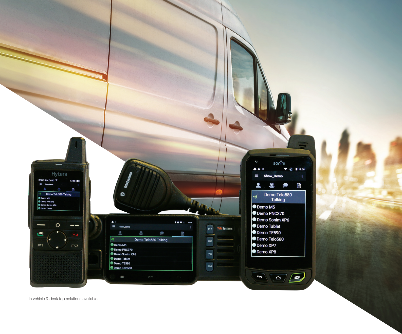
In vehicle & desk top solutions available