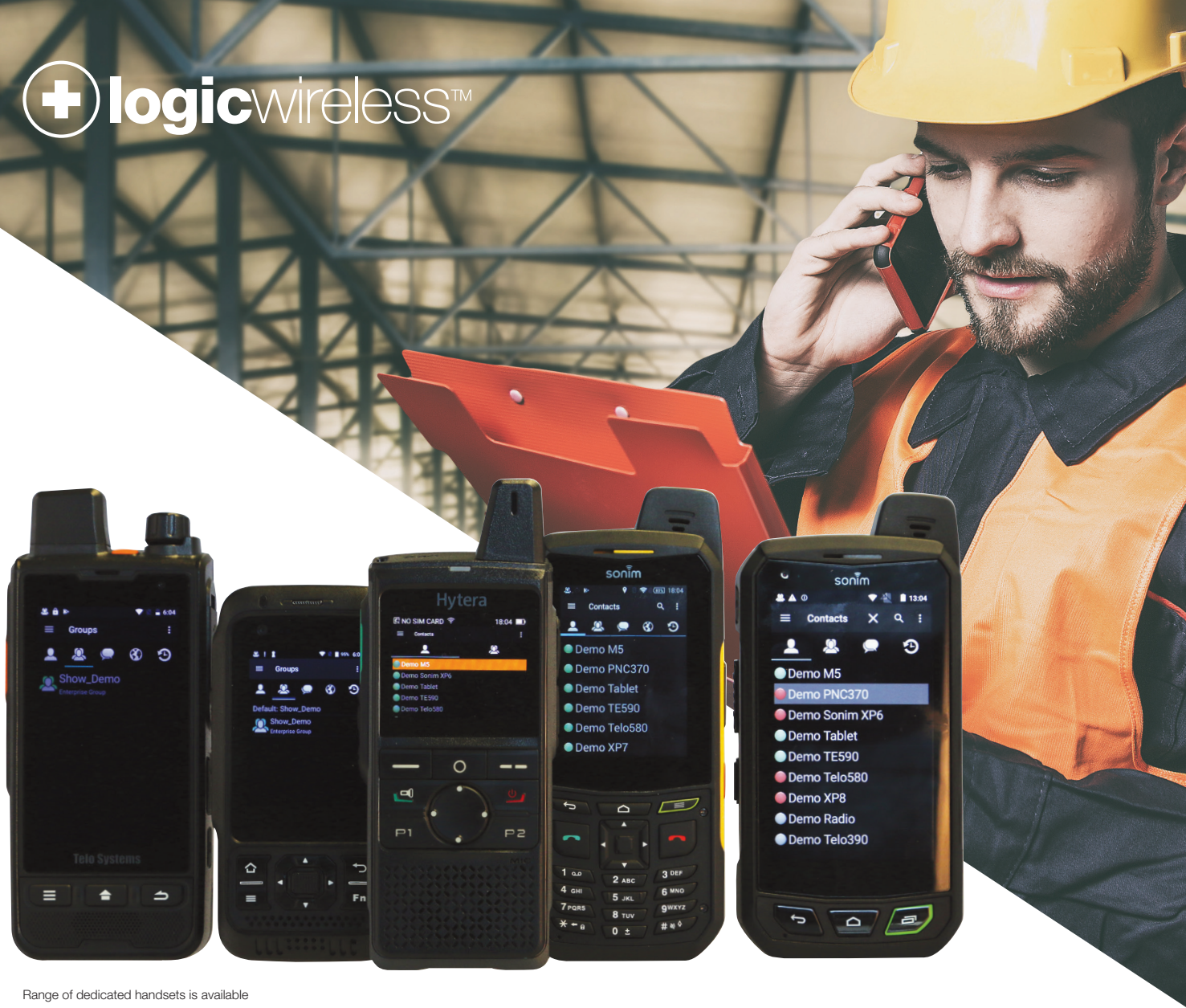
Range of dedicated handsets is available