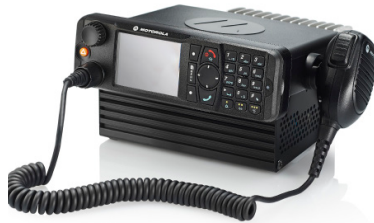
Motorola MTM800 TETRA