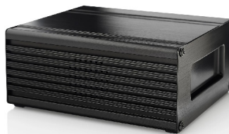
Battery Back-up Box AD-BBB