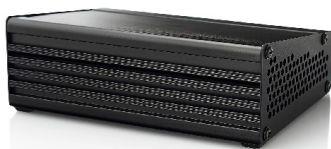
Universal Option AD-UNI