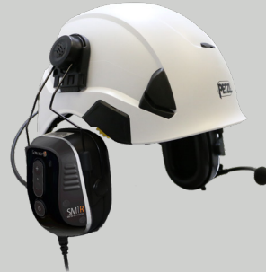
SM1RH001 | HELMET MOUNT 23dB NRR / 31dB SNR / 26dB, Class 5 SLC80