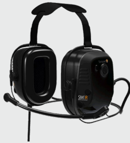
SM1RE001 | BEHIND-THE-NECK 24dB NRR / 30dB SNR / 27dB, Class 5 SLC80