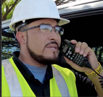
Intelligent vehicle network and edge computing platform in a familiar radio form factor.