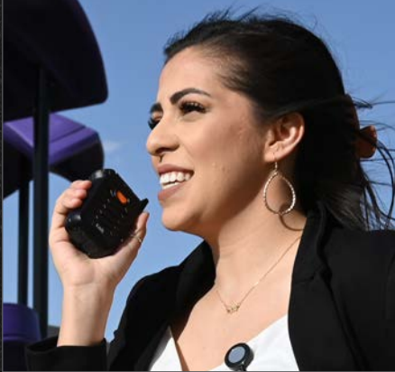
Compact, ruggedized, wearable broadband communications device for heads up operation.