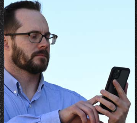
Broadband smart devices can bridge the gap between networks, devices and user locations.