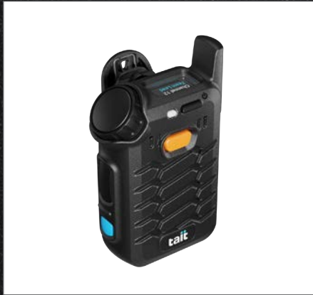
TAIT AXIOM Wearable is a compact, ruggedized, device for heads up communication.