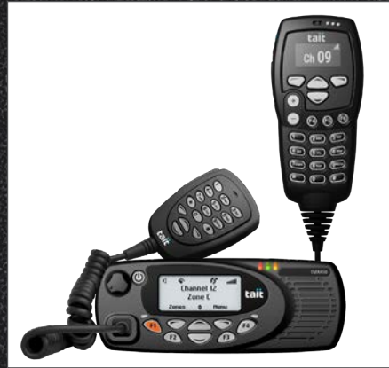
TAIT AXIOM Mobile provides a choice of vehicle installation and user interface options.