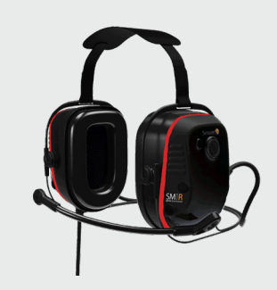
SM1 RISE1 | BEHIND-THE-NECK 24dB NRR / 30dB SNR / 27dB, Class 5 SLC80