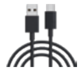
● USB Type-C cable